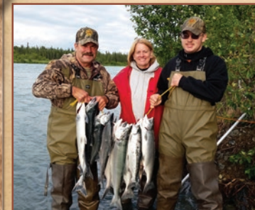
THE REED FAMILY PROUDLY HOLDS UP A NICE MID-JULY LIMIT.