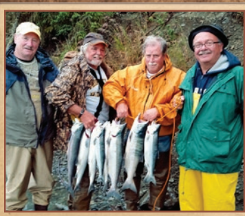
TEAM MICHIGAN WITH ONE OF THEIR MANY LIMITS OF KENAI SOCKEYE!